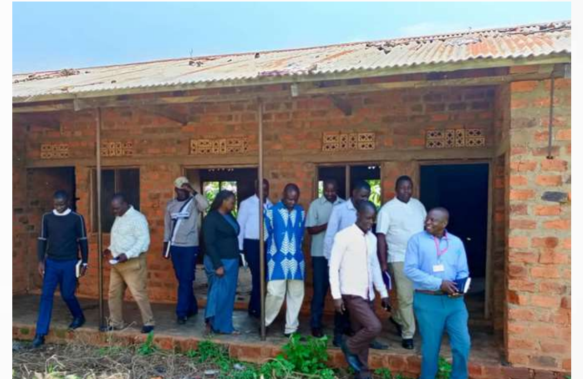
Being taken around for inspection