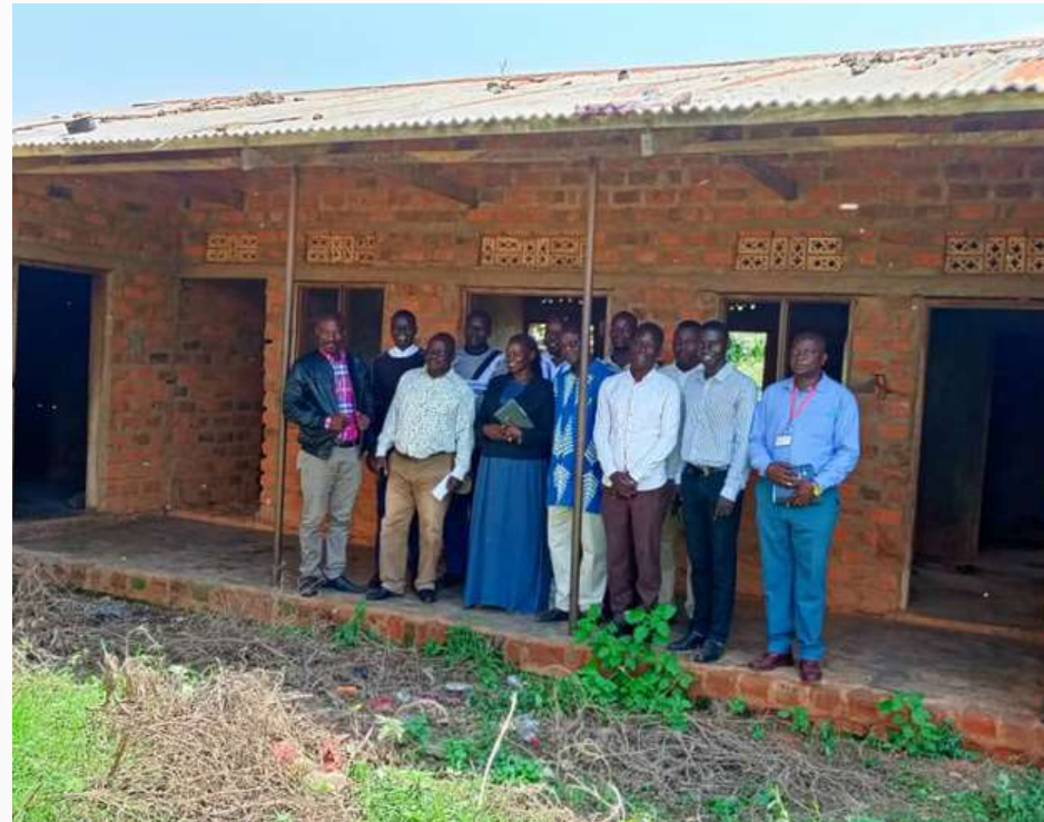
Grade one magistrate warmly welcomed to court premises at Sigulu Island, Namayingo District, by council members.