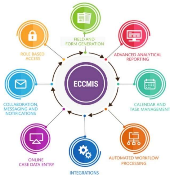
Key Features of the ECCMIS

Appeal/Constitutional Court, Divisions:- Anti Corruption, Civil, Commercial, Land, Luwero High Court and Mengo Chief Magistrates Court. The key features of the ECCMIS are:-